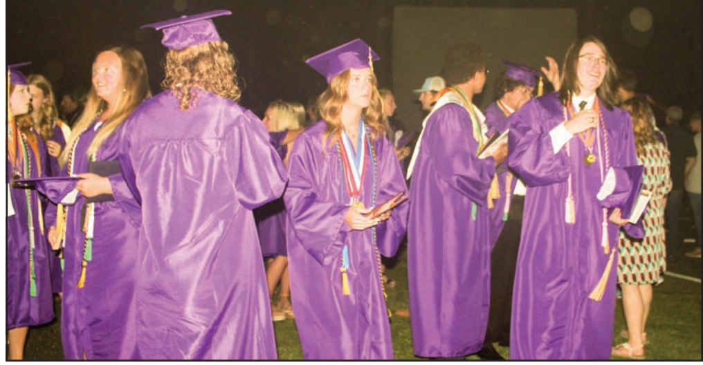
Graduates celebrating in the immediate aftermath of Commencement Exercises on May 20.