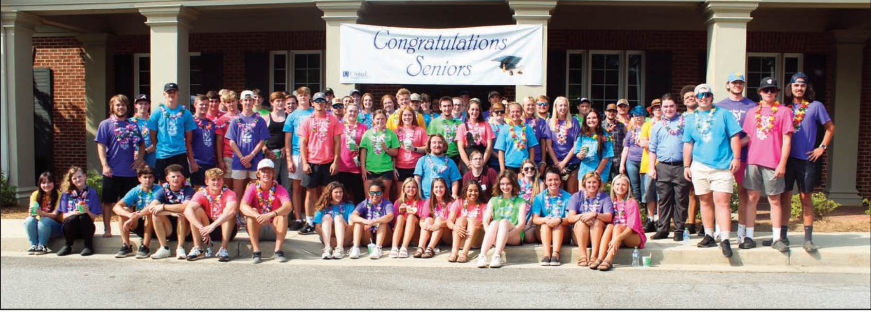
United Community Bank paid tribute to its community stakeholder status last week by celebrating the future of Union County with the return of its Senior Bash.